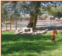
Daily Romping in Our Play Yard

For dogs, we have 14 inside runs, 9 outdoor covered runs and a fenced in play area. Dogs that stay with us are boarded in one of our indoor runs. Once daily, your dog will be let out to one of our outdoor